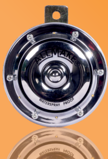
MASTER SUPER DLX